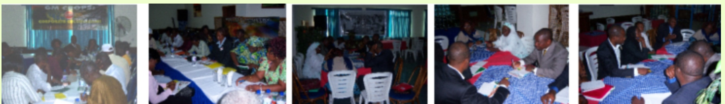
Day 2 : a cross section of the conference working group