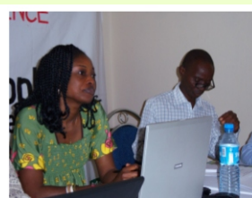
Day 1. Meeting of FoE, Africa at the Agrofuels workshop